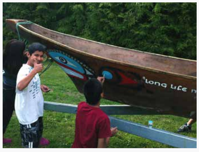
Youth painting Kw'umut Lelum's carved canoe

In 2001 , KL was granted C4 Delegation which included C3 services as well as guardianship services (foster care), and permanency planning for children in care. Le'lumilh Program of caregivers was implemented in the community, along with weekly parenting and play groups. Family Support Workers became Resource Workers, and the focus was on connecting children to their community to develop pride in their roots.